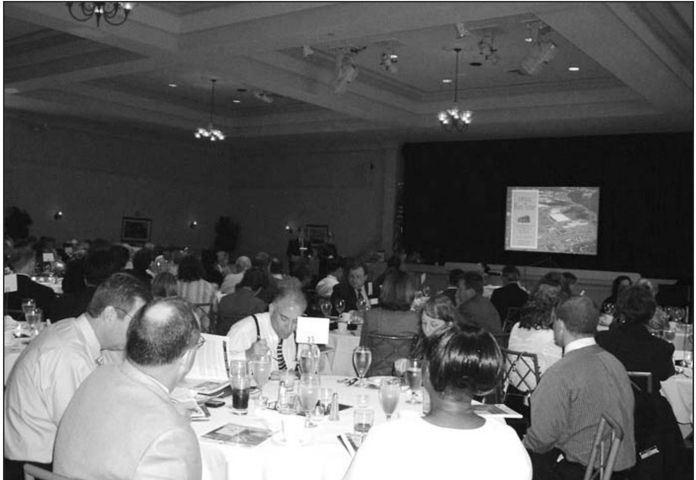
Virtual Bus Tour attendees network over breakfast prior to the commencement of the presentation.