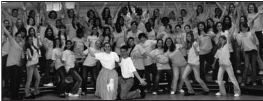
Parkside Middle School's Concert/Show Choir