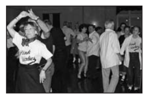
Dancers dressed in '50s attire for the Red Cross Sock Hop.

Save & SERVE Thrift Shop, a program of SERVE Inc. which provides free clothing and household items to its clients, has moved its donation drop-off and sorting center into the Nokesville Road warehouse. The thrift shop raises funds for the emergency shelter, food closet, emergency services and transitional housing. For more information, call 703-330-8777.